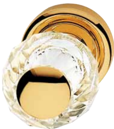
900 PG 103