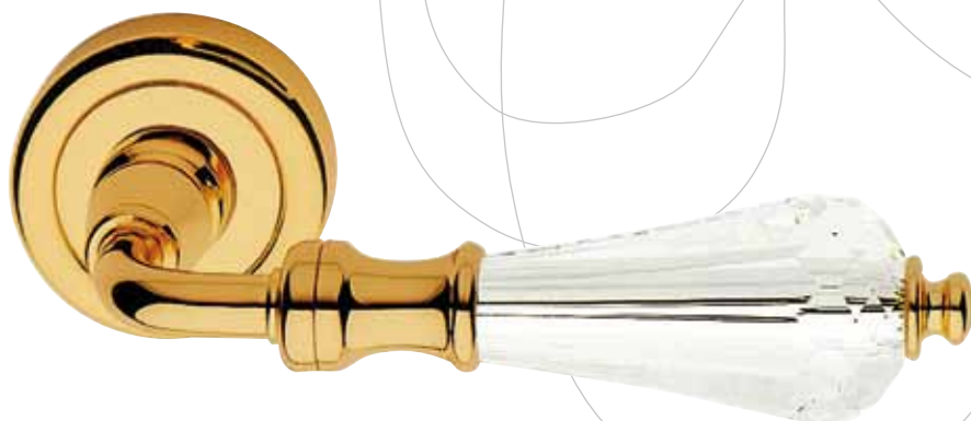
900 RB 103