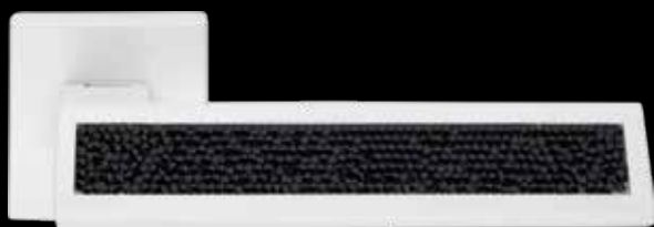
1358 RO 019 BA