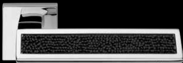
1358 RO 019 CR