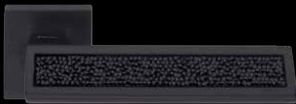
1358 RO 019 VE