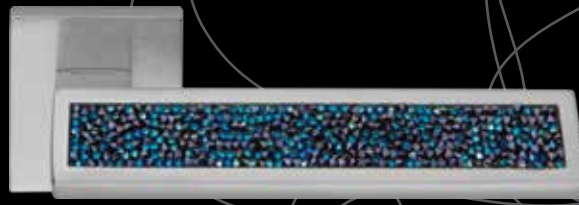
1351 RO 019 CS