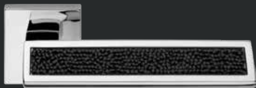
1358 RB 019