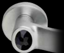
1347 RO 023 CS