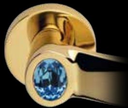
1346 RO 023 OZ