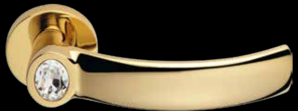
1345 RO 023 OZ