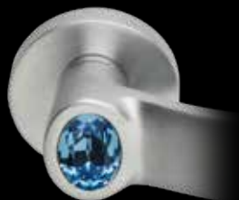
1346 RO 023 CS