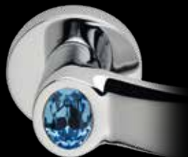
1346 RO 023 CR