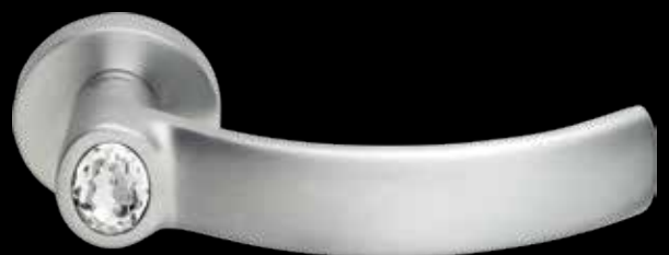
1345 RO 023 CS