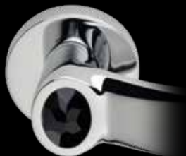
1347 RO 023 CR