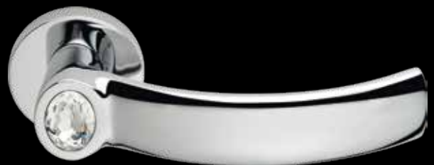
1345 RO 023 CR