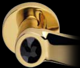
1347 RO 023 OZ