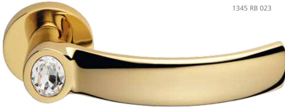
1345 RB 023