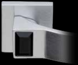
1343 RO 019 CS