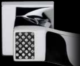
1348 RO 019 CR