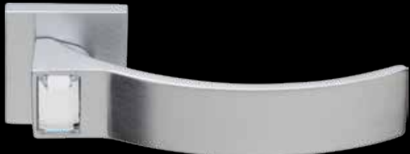
1340 RO 019 CS