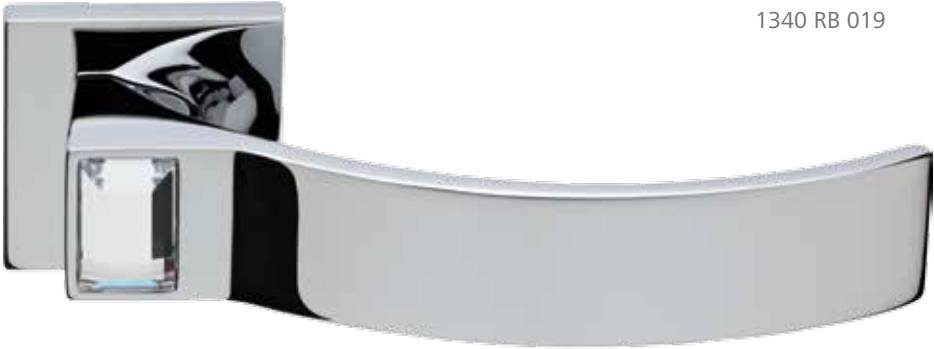
1340 RB 019