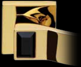
1343 RO 019 OZ