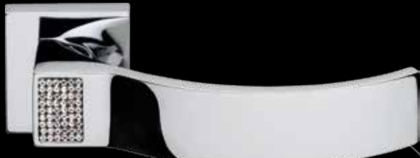
1344 RO 019 CR