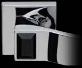
1343 RO 019 CR