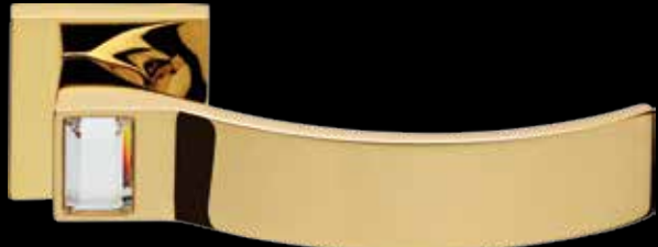
1340 RO 019 OZ