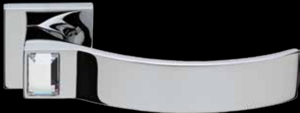
1340 RO 019 CR